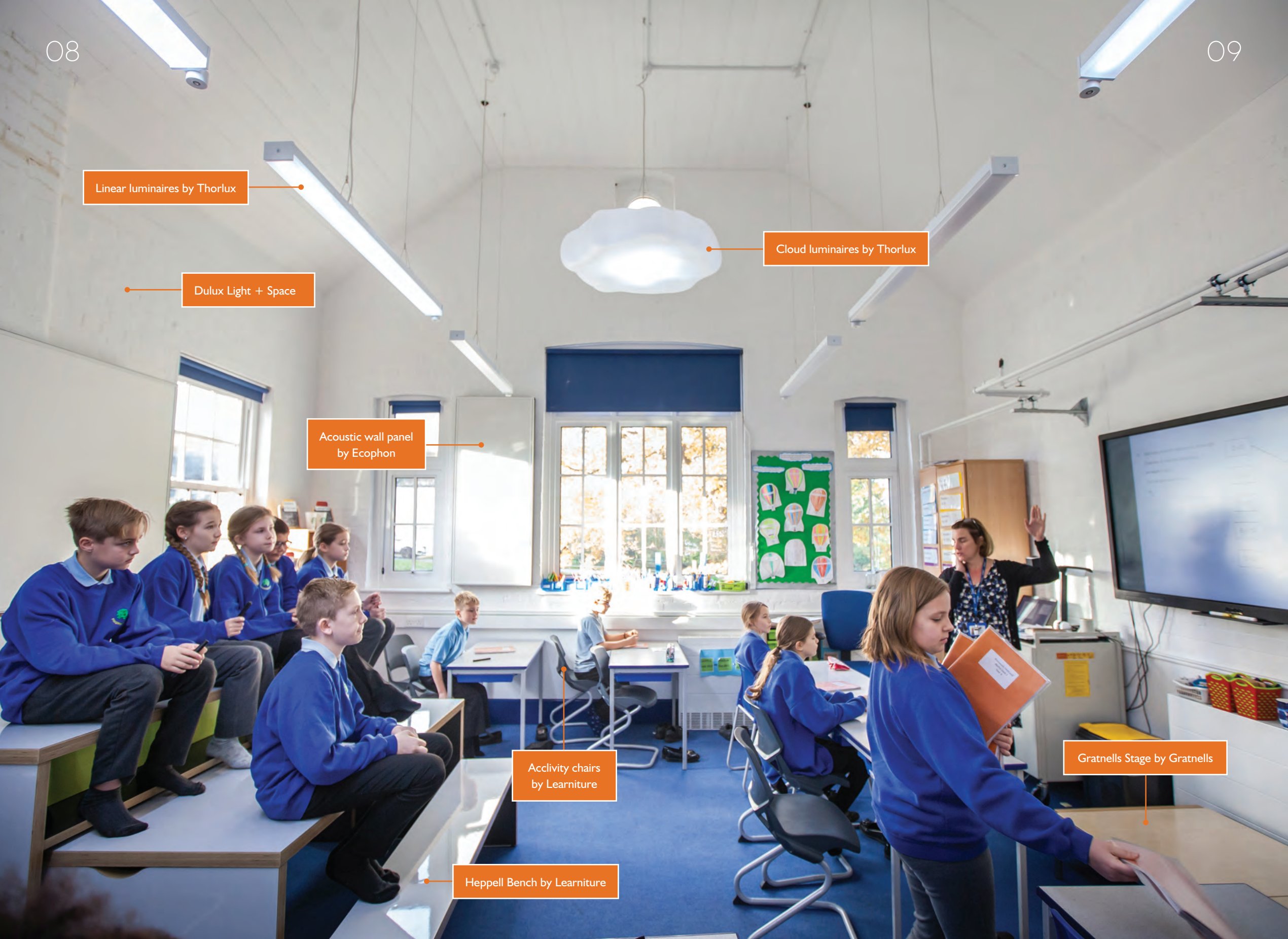
Gratnells Stage by Gratnells